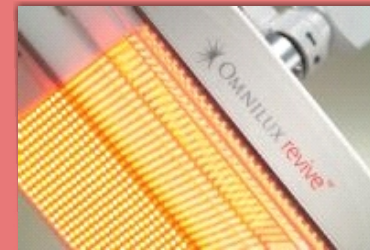
Omnilux revive™ showing a section of the LED panels

Omnilux™ uses a combination of pure, visible red and infra red light to stimulate the deeper skin tissue, leading to a softening of fine lines, improved skin tone and super smooth skin.