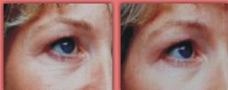
45 yr old female, skin type II, 14 days post treatment

Optimum hydration of subject's skin was seen at 5 weeks post treatment. Mean elasticity measurements showed a decrease in the treated side of the face during the treatment regime.