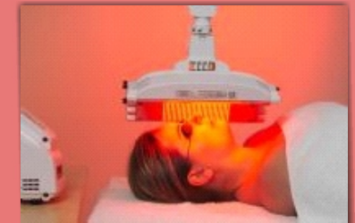
Omnilux revive™ in action